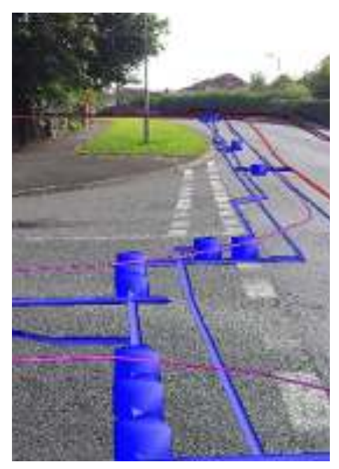
Figure 1. Utilities under road.

Once positioning technologies are sufficiently precise and in areas where the position of utilities pipes are well known, such services may become available to lay people and nonprofessional users.