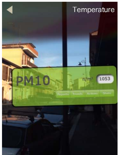
Figure 4. Sensor readings must be backlit to be seen in context with the surrounding environment.

Being unavailable (or slow in obtaining position) when satellite signals are absent such as underground, indoors, in urban