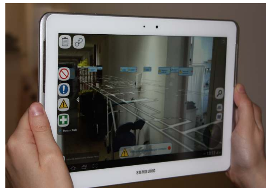
Figure 2. Emergency responders will use AR to find and follow the safest route through a building. Safety management operators will be prompted to manage a risk situation in real time

Unfortunately, indoor navigation with only the support of an Inertial Measurement Unit (IMU) is immature and not sufficiently precise. Furthermore, the systems based on commercial (mass market) platforms do not have barometers and other indicators of elevation, so the device is unable to automatically choose the floor plan for the correct floor. Finally, holding the mobile device for rapid consultation reduces the ability of the emergency responder to use both hands for other tasks.