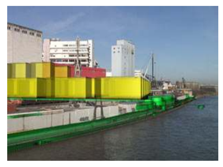
Figure 3. Novartis campus and the river Rhine.

In these different environments (e.g., virtual, physical off site, physical on location), the architect, customers, citizens and any other stakeholders can provide feedback verbally or through voting or other mechanisms. Unfortunately, even the best of these tools are limiting. Models are frequently insufficient to fully grasp the height of the proposed change or new building.